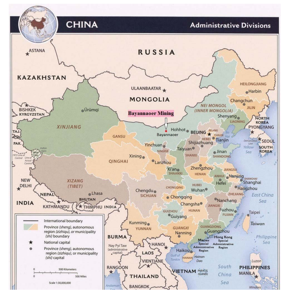
The Moruogu Tong Mine of Bayannaoer Mining is located in Wulatehouqi, Bayannaoer City, in the Inner Mongolia Autonomous Region of the PRC. The mine is approximately 45 kilometers to Chaogewenduer Town and 40 kilometers to Qingshan Town. The Qingxian Road passes through the southern part of the mine and transportation is very convenient. Connectivity to water, electric and other necessary services will be addressed at the time of mine construction and development. The current exploration permit for the Moruogu Tong Mine runs from September 14, 2019 to September 13, 2021 and covers a site area of 10.43 square kilometers.

The following diagram shows the geography of Bayannaoer Mining's exploration site and its surrounding areas: